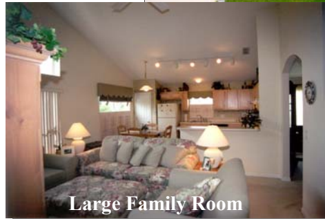
Large Family Room