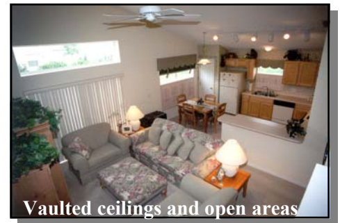
Vaulted ceilings and open areas