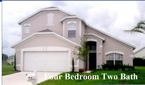
Four Bedroom Two Bath