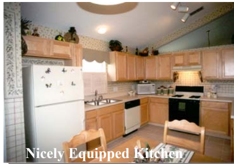
Nicely Equipped Kitchen