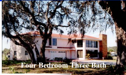
Four Bedroom Three Bath