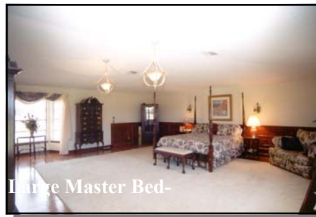
Large Master Bed-