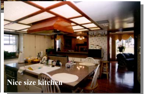
Nice size kitchen