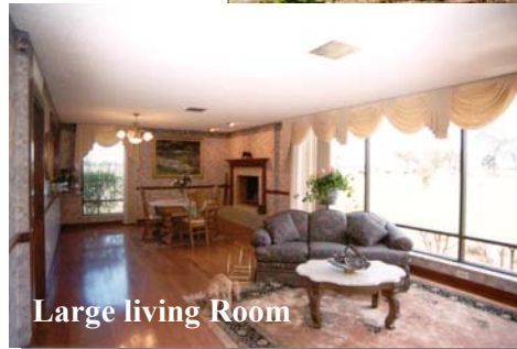
Large living Room